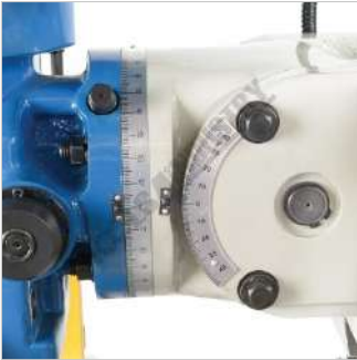
Universal Tilting and Rotating Head