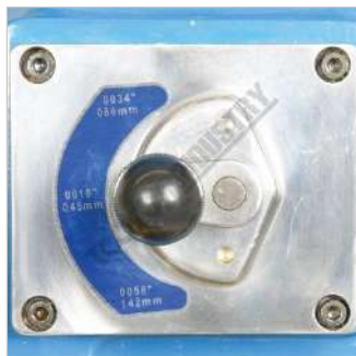
Feed Speed Selector Lever