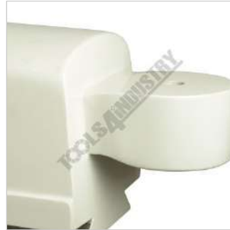
Tail Lug Spigot Supports Slotting Head