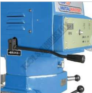
Spindle Brake Lever