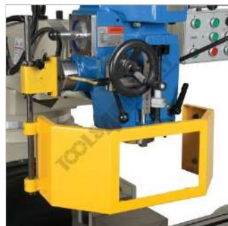
Safety Cutter Guard