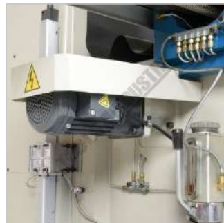
Z Axis Elevating Motor