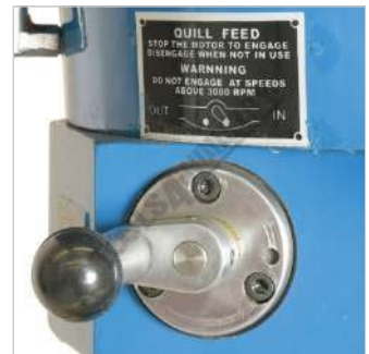
Quill Feed Engage Lever