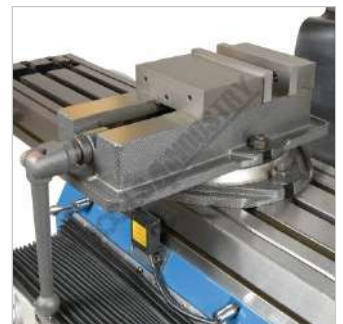
Includes Machine Vice