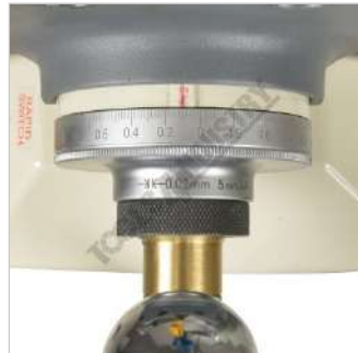
X Axis Dial Graduations