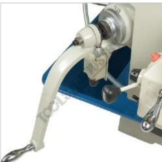
Z Axis Handle