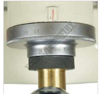
Y Axis Dial Graduations