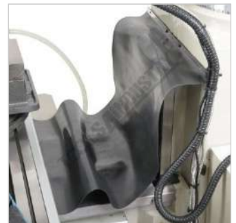
Rear Slideway Protection Cover