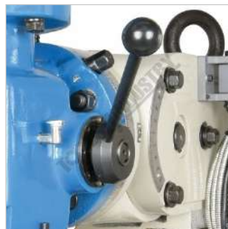
Quill Hand Lever