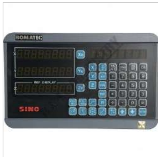
3 Axis Digital Readout