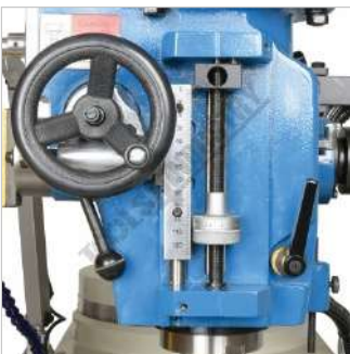
Quill Feed Depth Stop