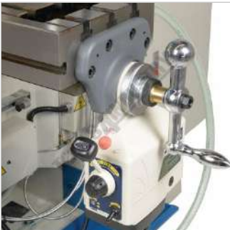
X Axis Power Feed with Rapid