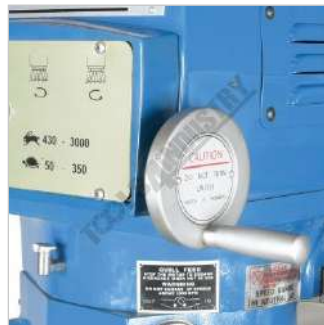
Variable Speed Hand Wheel