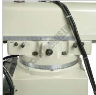
Adjustable Swivel and Sliding Ram