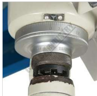
Z Axis Dial Graduations