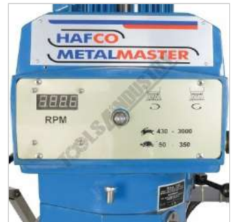
Variable Speed Digital Display