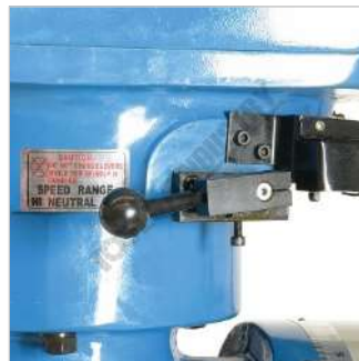
High Low Speed Range Selection Lever