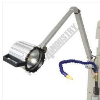
Work Light and Coolant Hose