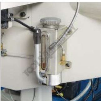
Manual Slideway Lubrication Pump