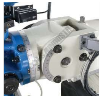
Head Tilt Knuckle