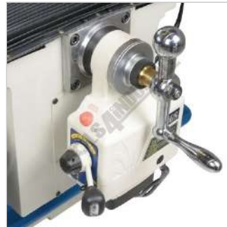
Y Axis Power Feed with Rapid