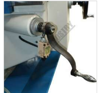
Micro Switch on Knee Handle