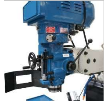
Mill Head Right View