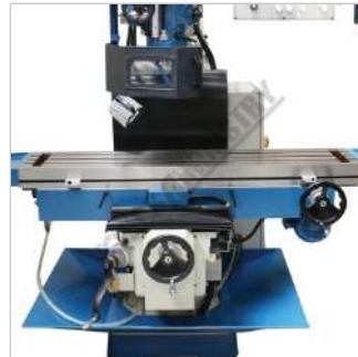
Extra Wide Saddle Support