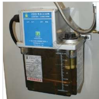
Automatic oil lubrication pump and reservoir