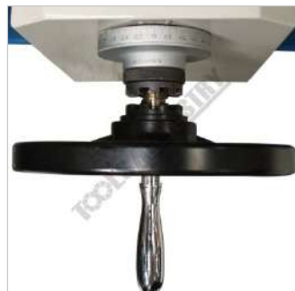
Cross Feed Handle