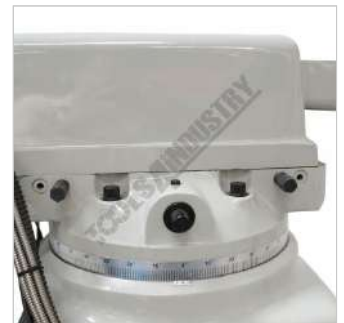
Adjustable Swivel & Sliding Ram