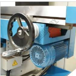
Heavy Duty X Axis Feed Motor