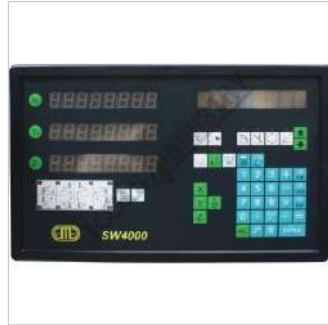
3 Axis Digital Readout