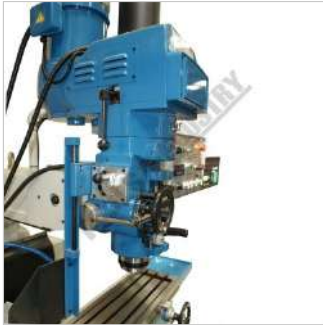
Head Left Side View