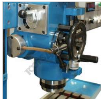
Quill Feed Mechanism