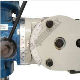
Universal Tilting and Rotating Head